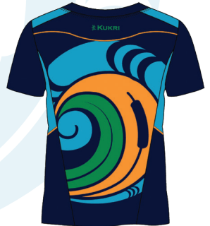
Multisport tee (front and back)