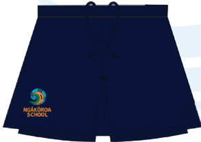
Polo, shorts and skort