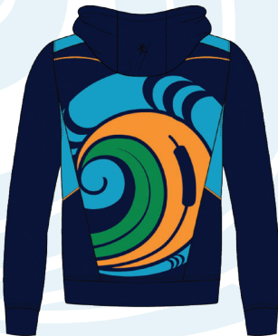
Hoodie (front and back)